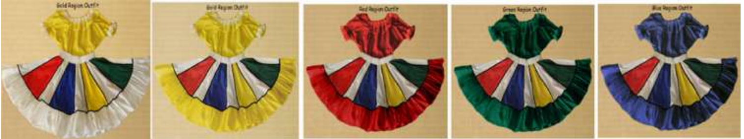
Gold Rush Region Outfit